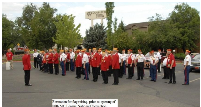
Formation for flag raising, prior to opening of 88th MC League National Convention