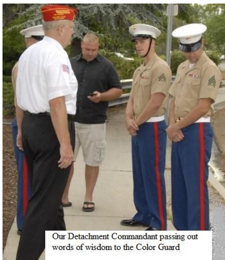
Our Detachment Commandant passing out words of wisdom to the Color Guard