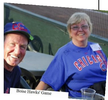
Boise Hawks' Game