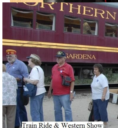
Train Ride & Western Show