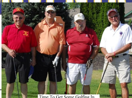
Time To Get Some Golfing In